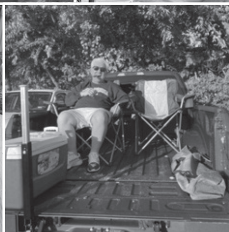
Day 7 of the quarantine My wife took up gardening but won't tell what she's going to plant